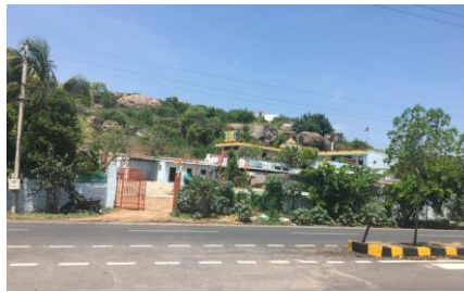
View 16: Hanuman Temple opposite to the Centre, South of 100' Road