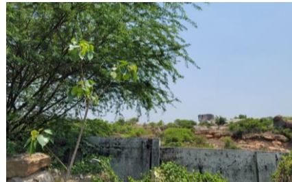
View 20: Compound wall facing 100' road at the south-east corner of the campus