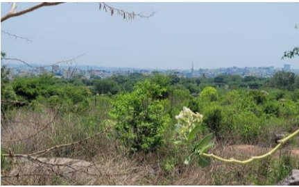
View 15: From 100' West road Looking towards North