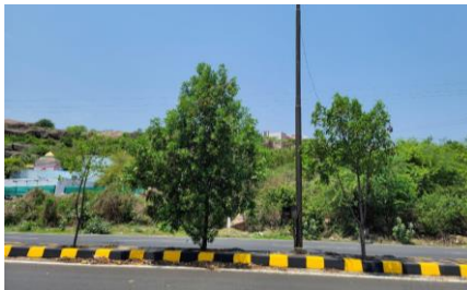
View 19: Hanuman temple viewed from the edge of the Property facing the 100' Road