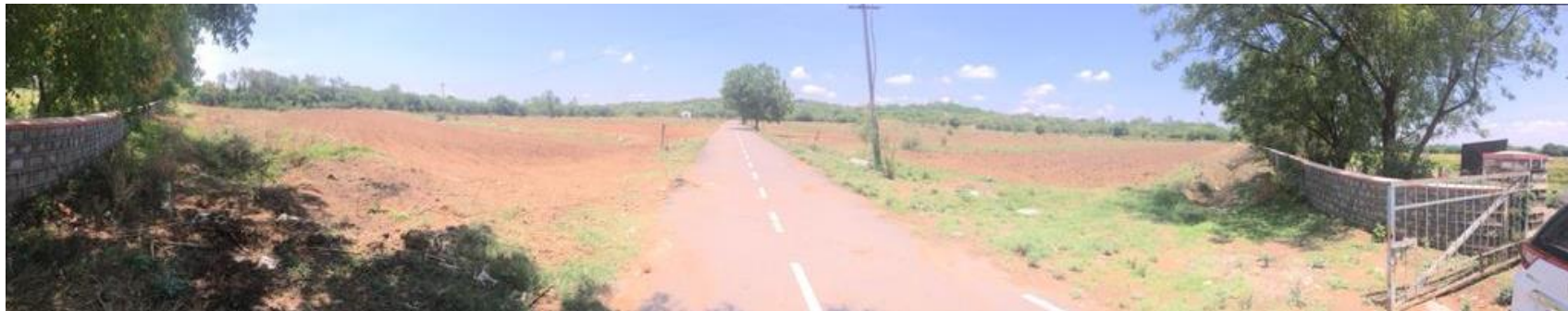
View 21: Panoramic View (180°) of the entire campus standing at the North gate and facing South