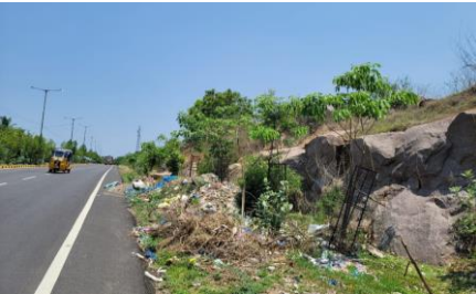
View 18: From south property view along the Road