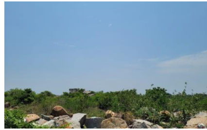
View 17: From south of Property Viewing towards the cluster of Boulder-1 Location